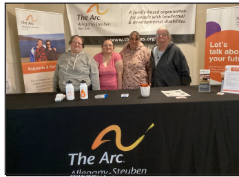
Steuben County Fair Booth

The Arc Allegany-Steuben spent a week at the Allegany County Fair (July 14th - 19th) and the Steuben County Fair (August 12th - 17th) this summer. Associates from various departments across the agency signed up to work the booth and share all the great things the Arc does.