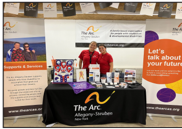
Allegany County Fair Booth