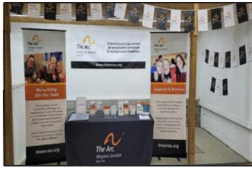
Allegany County Fair Booth