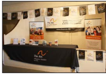
Steuben County Fair Booth

The Arc Allegany-Steuben spent a week at the Allegany County Fair (July 15th - 20th) and the Steuben County Fair (August 13th - 18th) this summer. Associates from various departments across the agency signed up to work the booth and share all the great things the Arc does.